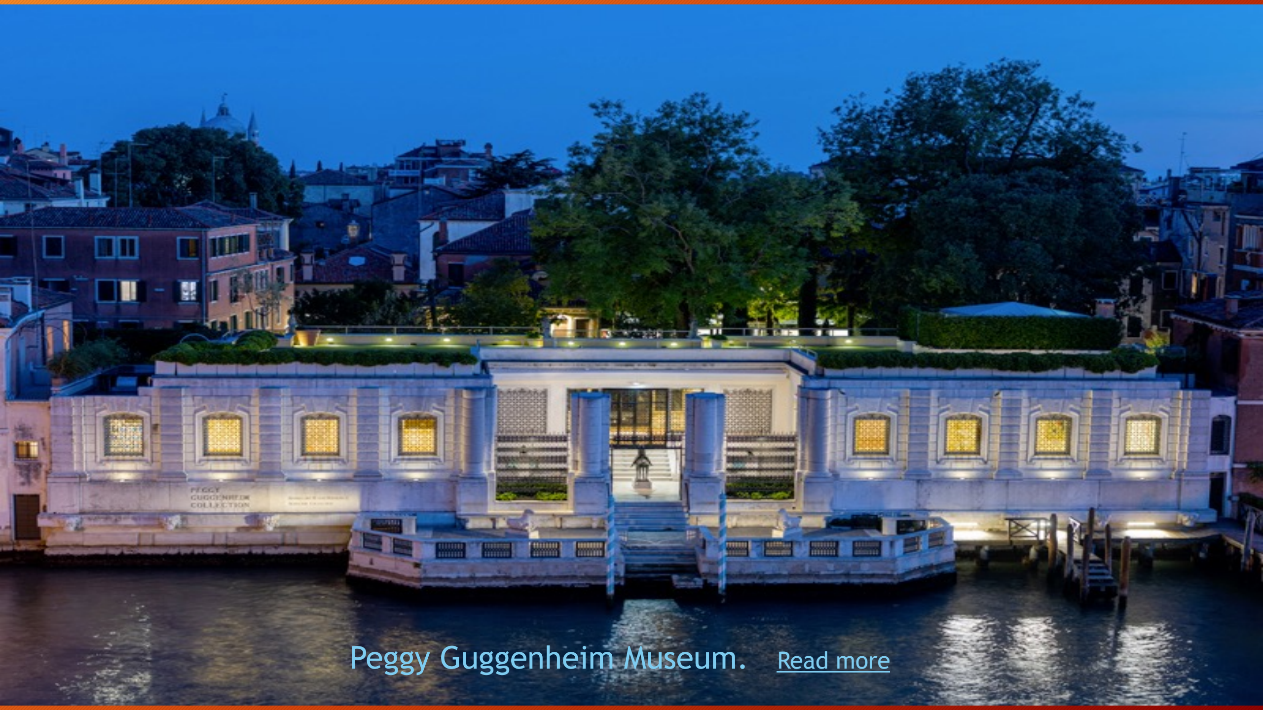
Peggy Guggenheim Museum. Read more