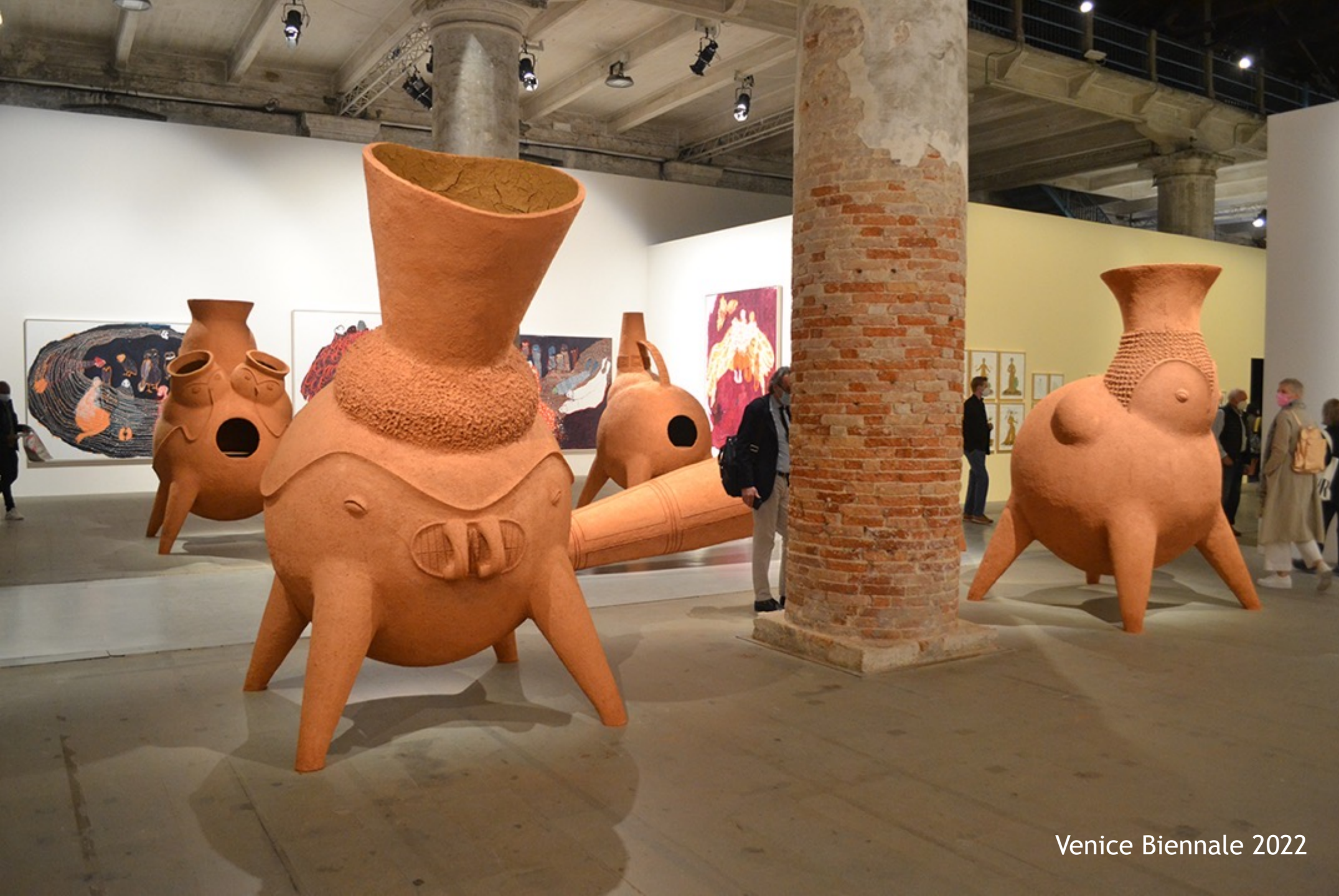
Venice Biennale 2022