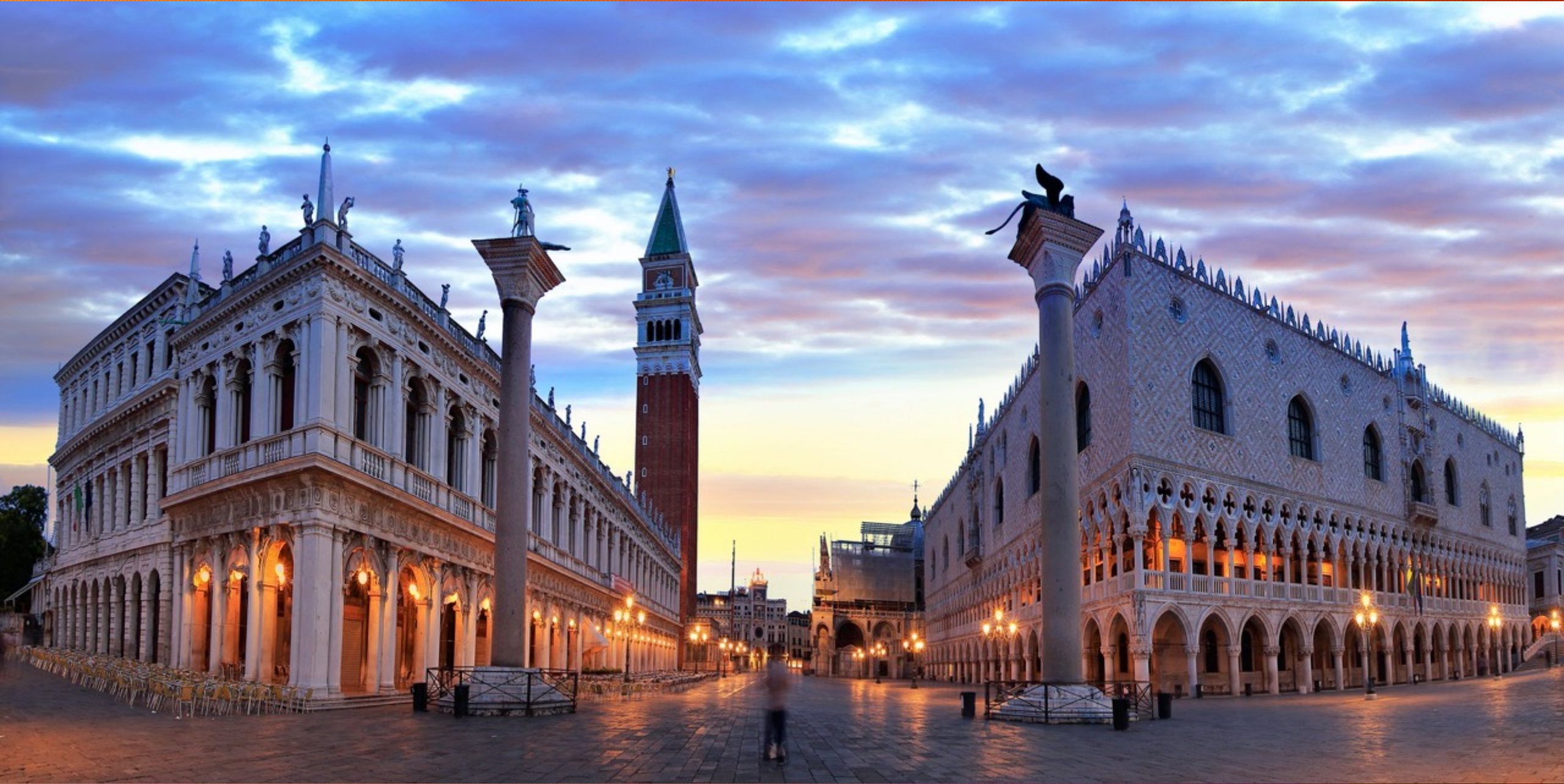
Palazzo San Marco and Doge's Palace