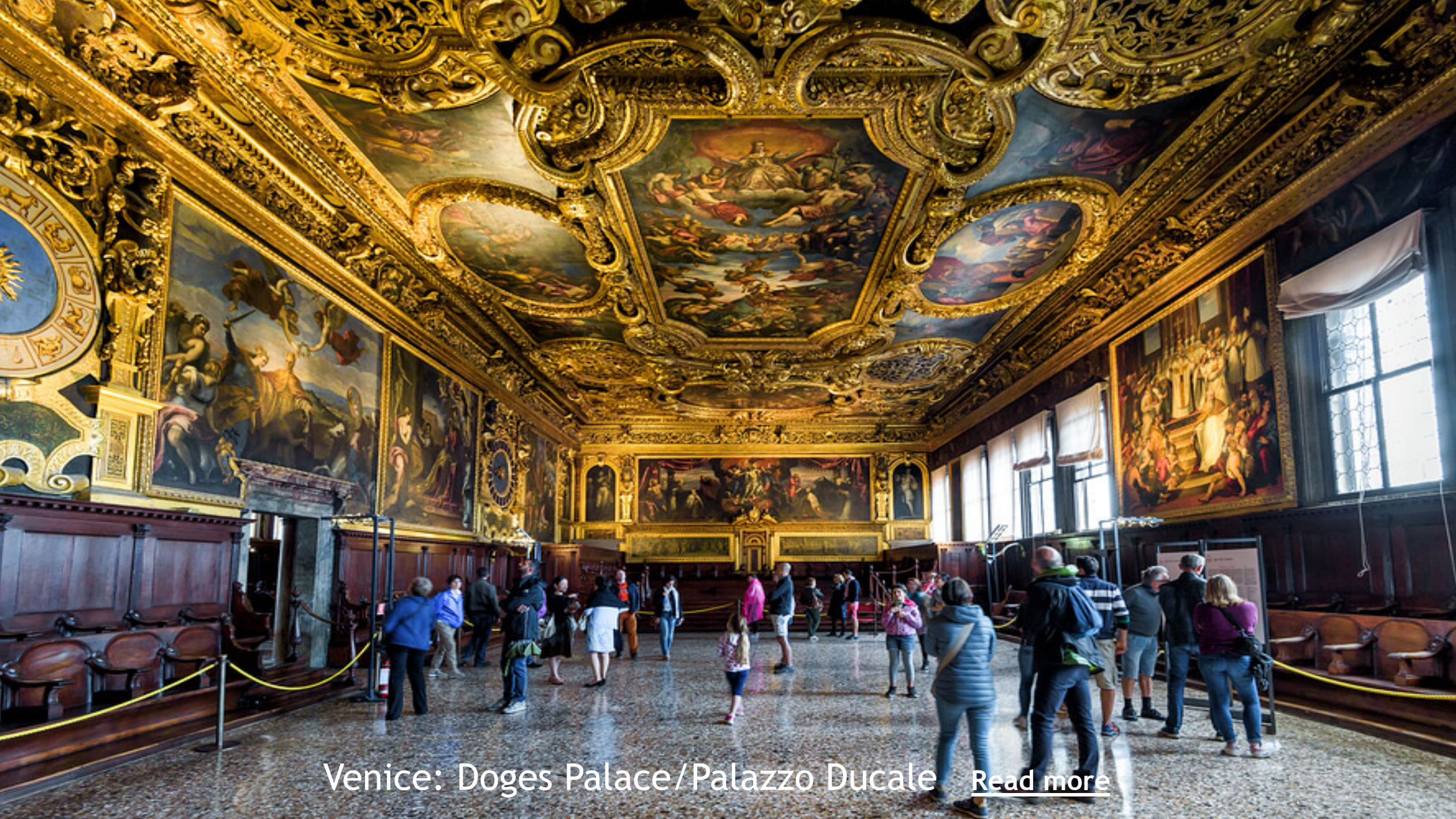
Venice: Doges Palace/Palazzo Ducale Read more