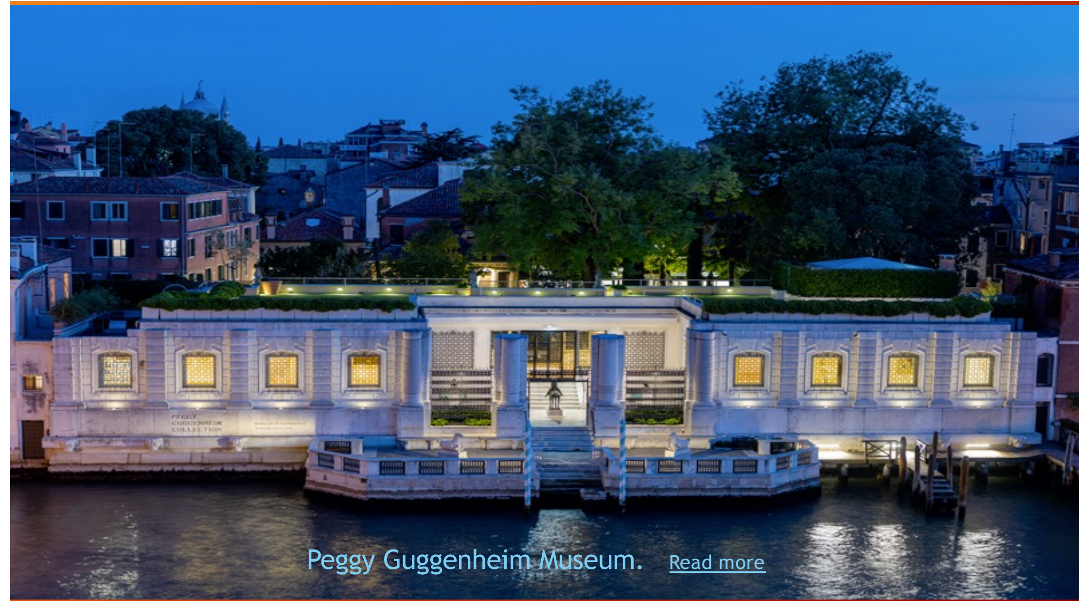
Peggy Guggenheim Museum. Read more