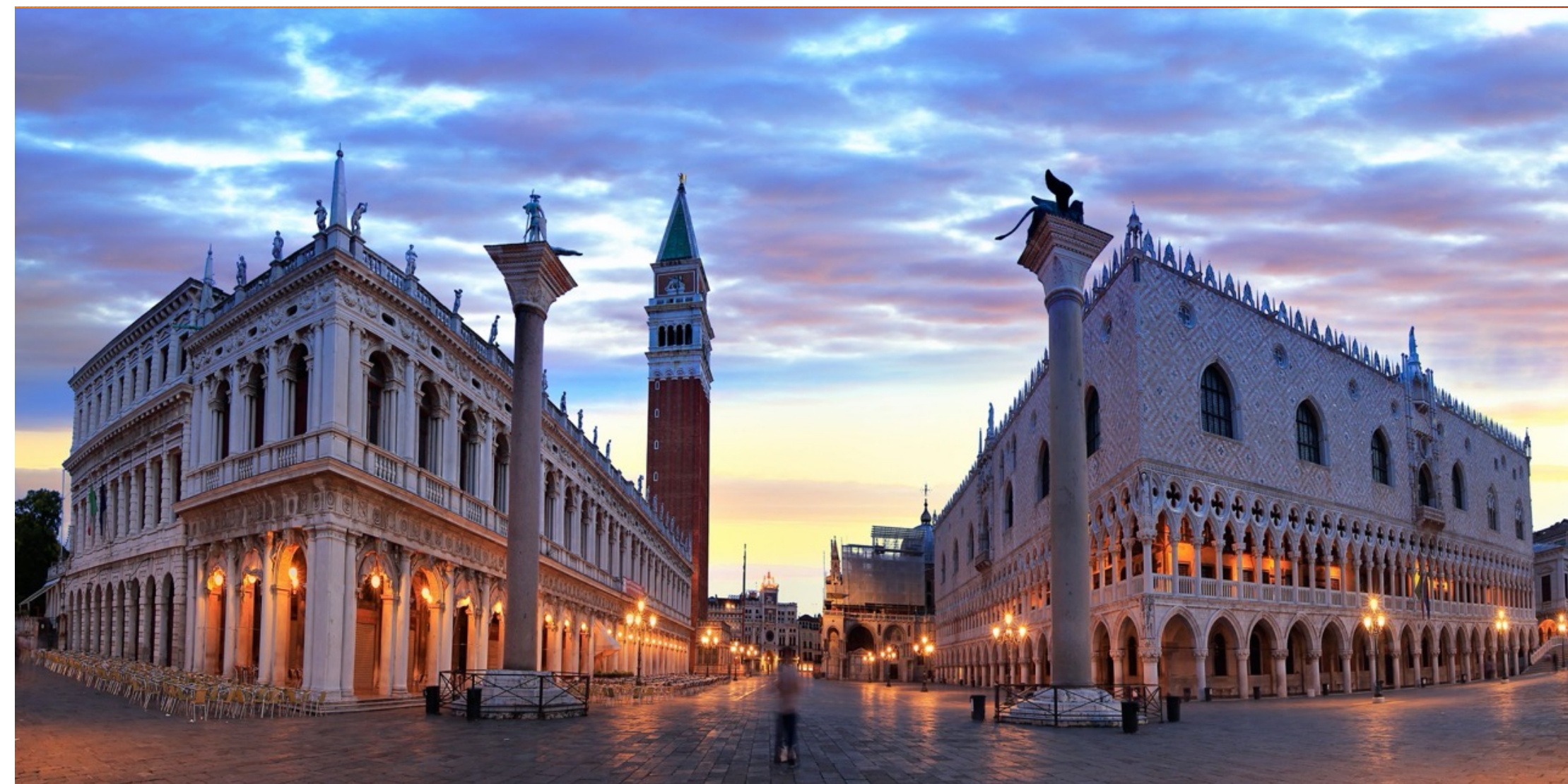
Palazzo San Marco and Doge's Palace