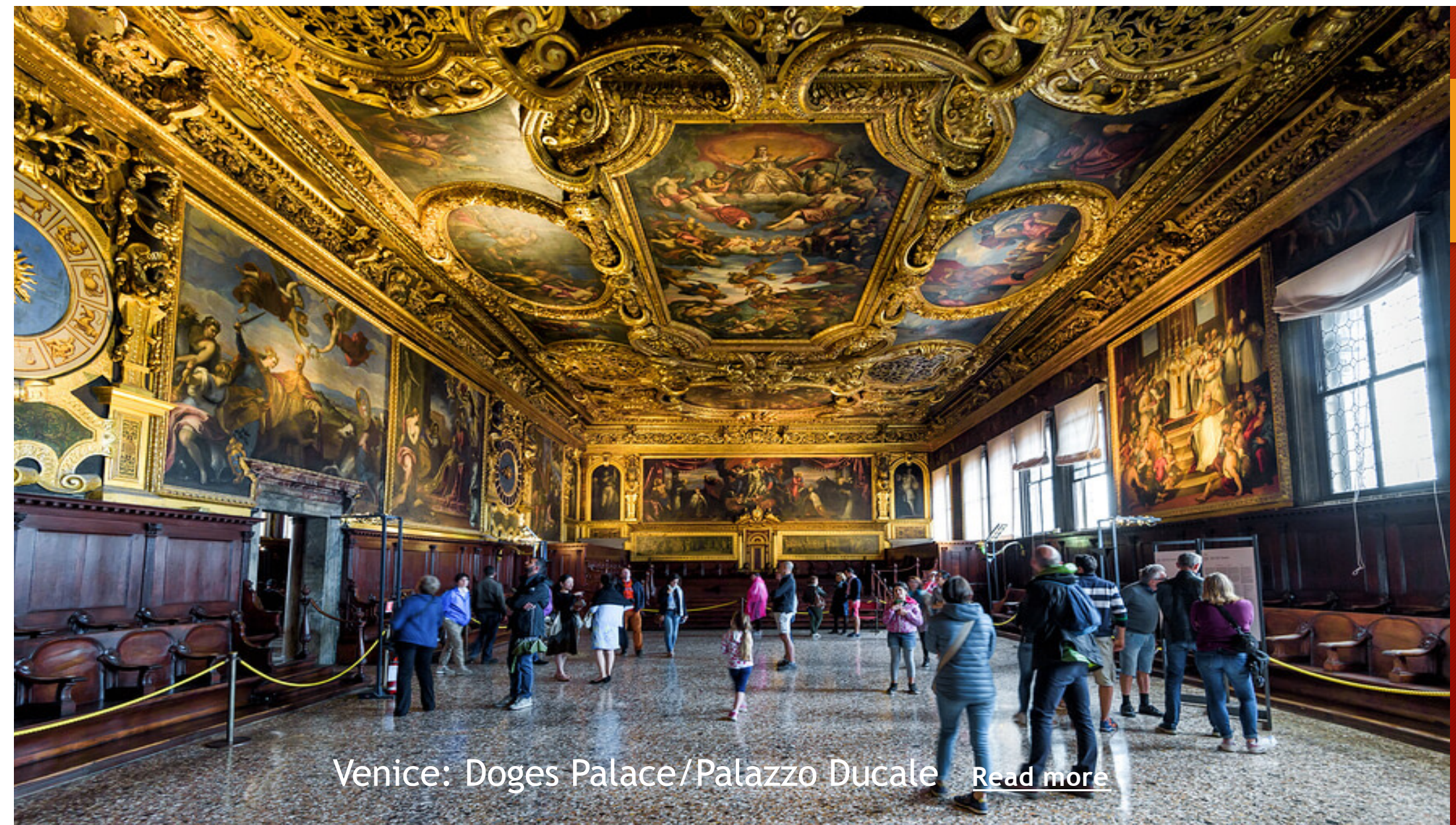
Venice: Doges Palace/Palazzo Ducale Read more