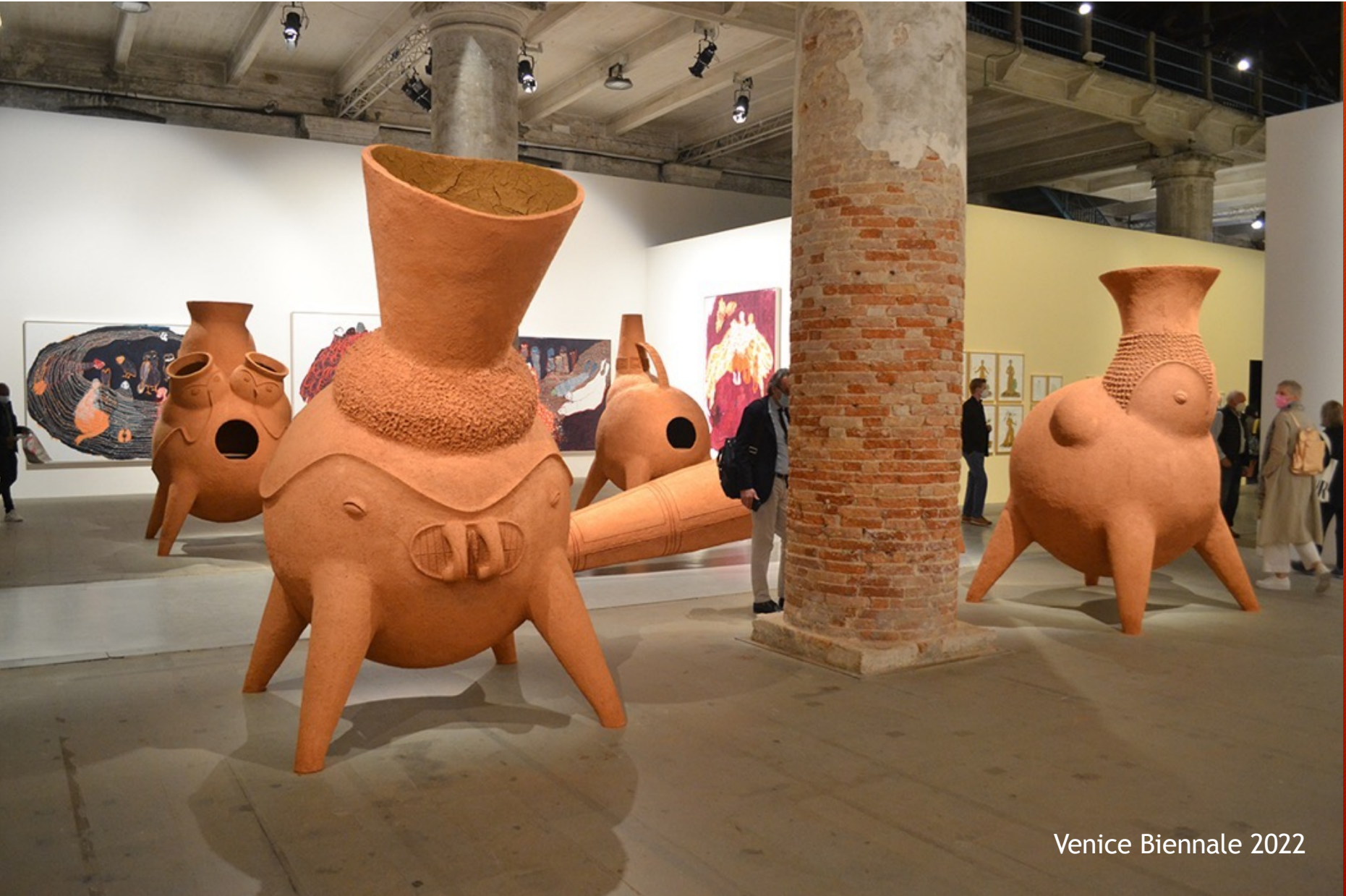
Venice Biennale 2022